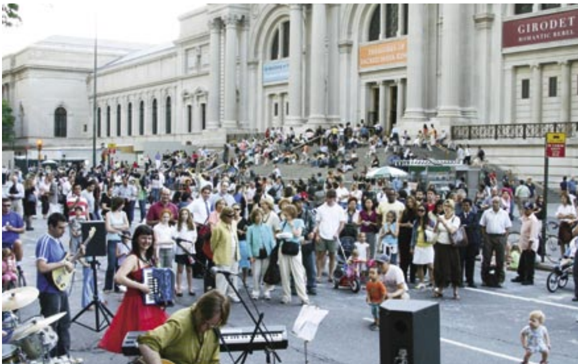
Above: At Grand Army Plaza, Brooklyn, the emphasis on traffic precludes nearby institutions from creating a strong public presence Below: New York’s streets can support its great institutions, but are only afforded the chance to do so during car-free events such as the Museum Mile Festival

These problems are intertwined. The only way to untangle the knot is to strategically coordinate solutions that complement each other. In that spirit, PPS proposes nine steps to transform New York into a city of great places.