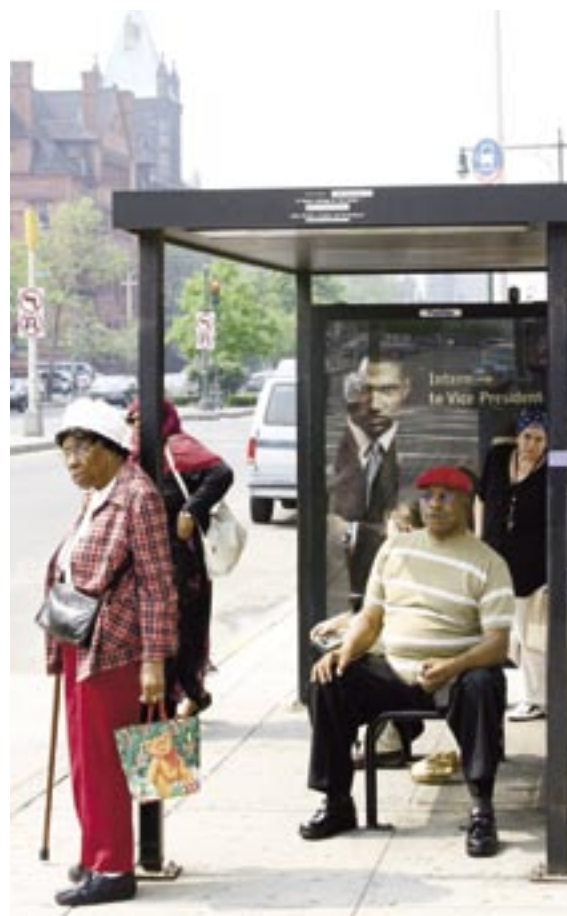
Above: Grand Street envisioned as a pedestrian-oriented street with sidewalk amenities Right: Bus shelter, Malcom X Boulevard

Invest in other modes of transportation. London uses its congestion pricing revenue to fund transit improvements. Likewise, New York should invest in its most under-utilized transit option: the bus. With fewer cars on the road, bus routes can be made much speedier through improvements such as bus-only lanes, bus stop bump-outs, and bus rapid transit lines, which offer many of the advantages of light rail at a lower cost. Bicycling, too, can become a safe, mainstream transportation option and an enjoyable, healthy form of recreation for children, seniors and everyone in between.