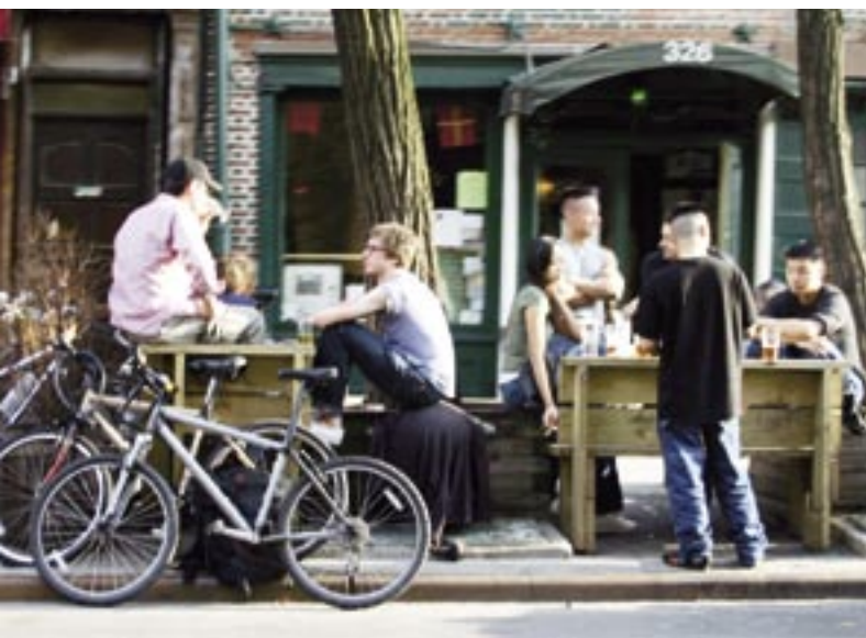
Above: Spring Street could function as a comfortable public space with shade, seating and spacious sidewalks

When New York’s streets serve as lively pedestrian destinations themselves, it will become easier for people to access other destinations—from new public squares to neighborhood delis, major cultural institutions to local playgrounds. In fact, this is perhaps the best way that our over-taxed transportation system can increase its performance. Simply put, by turning streets and sidewalks into destinations themselves, New York can connect more people to more places—accomplishing more while driving less.