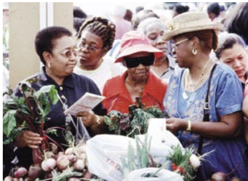
Above: Union Square Greenmarket Right: Customers at East New York Farms, Brooklyn

New York City needs some mechanism, perhaps a non-profit development entity, to facilitate the start-up of new markets, especially on underused city-owned property or other public spaces that should be centers of civic life.