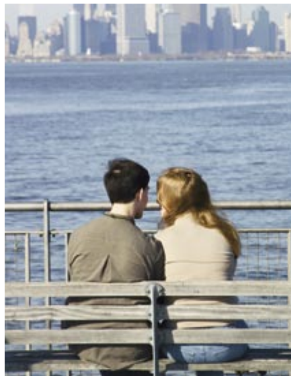
Above: Water Taxi Beach, Long Island City, Queens Right: 68th Street Pier, Bay Ridge, Brooklyn

The world's best waterfronts feature a rich diversity of activity, with no single use outstripping the others. New York can still become a great waterfront city, but only if the new round of projects evolve beyond the narrow confines of one-dimensional plans. The full range of possibilities for waterfront sites must be explored. Instead of big box stores choking off activity with their parking lots and traffic, or high-rises erecting a visual and physical barrier to the water, or passive parks that monopolize space, waterfront development should strive to balance commerce, housing, recreation, maritime activity, and other uses. Connect this mix to interior neighborhoods with improved surface-level transit service and walkable streets, and New York will finally have the waterfront it's been yearning for.